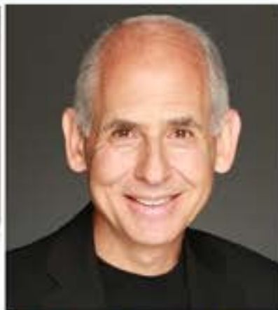
Daniel Amen, MD